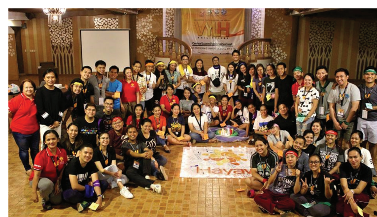
Members of Batch Hayaw and organizers of the regional camp

To be a volunteer, one does not necessarily need to have so much time in their hands. One only needs to have a heart full of compassion and a helping hand that is unselfishly caring.