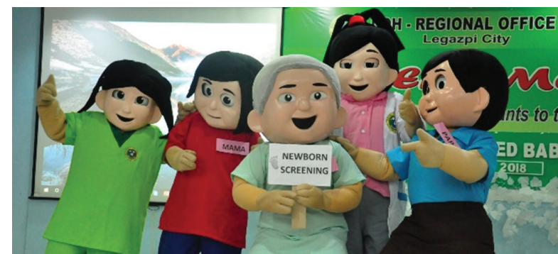
Children were treated to games and a mascots show featuring both family members and health workers.