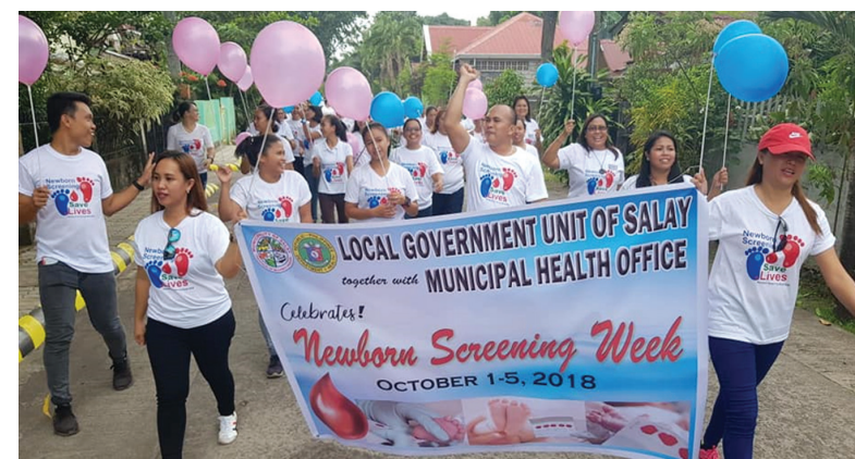
Officers and staff of LGU Salay parade through town promoting newborn screening.

Every year, NSC-M enjoins all newborn screening facilities (NSFs), both private and government, to celebrate NBS Week through a Mindanao-wide NBS Campaign Contest to encourage NSFs in the region to advocate the program more effectively and creatively.