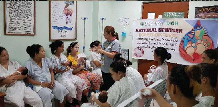
Top: Staff and volunteers from JBLMRH carry supplies to one of the hard-to-reach communities. Bottom: A health worker discusses newborn screening to a room full of mothers and newborns.