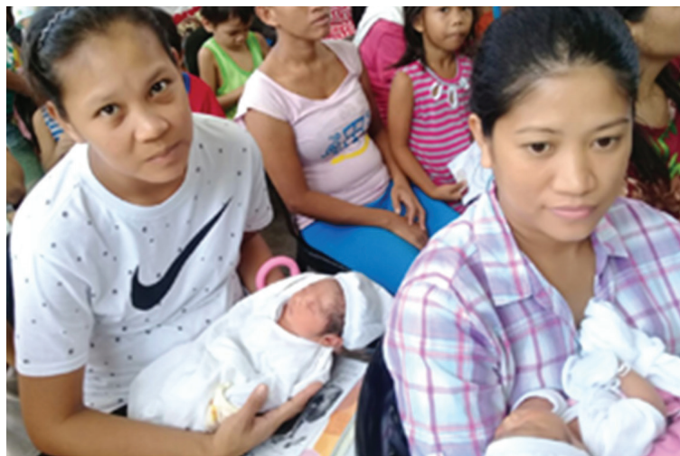
Clockwise from top left: NBS Coordinators prepare materials for the NBS activity in Arayat District Hospital; mothers and their newborns queue up for free NBS provided by JBLMRH; NSC-CL staff discuss the importance of newborn screening during an activity held in Porac; ERDH staff together with the recipients of free NBS; San Simon residents filled up the covered court wherein activities were prepared by RHU San Simon.