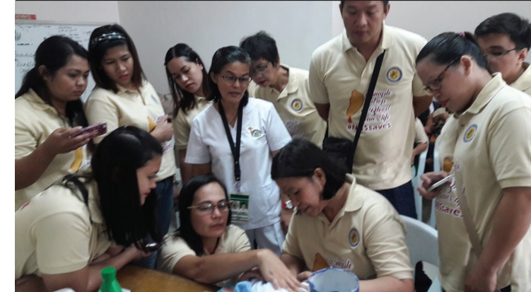
Participants undergo hands-on heel prick training at Cotabato Provincial Hospital in Kidapawan City.

Rural Health Unit (RHU) Balay Paanakan is a local government unit (LGU) facility providing health services to the people of President Roxas, North Cotabato. Among these services, free NBS to indigents and non-PhilHealth members is the most notable. In addition, the facility houses and caters to the needs of pregnant mothers who are a few weeks away from delivery. Families of the pregnant mothers receive groceries as well. Truly, RHU Balay Paanakan possesses a scheme worthy of being replicated by other facilities to help increase NBS coverage in their respective areas.