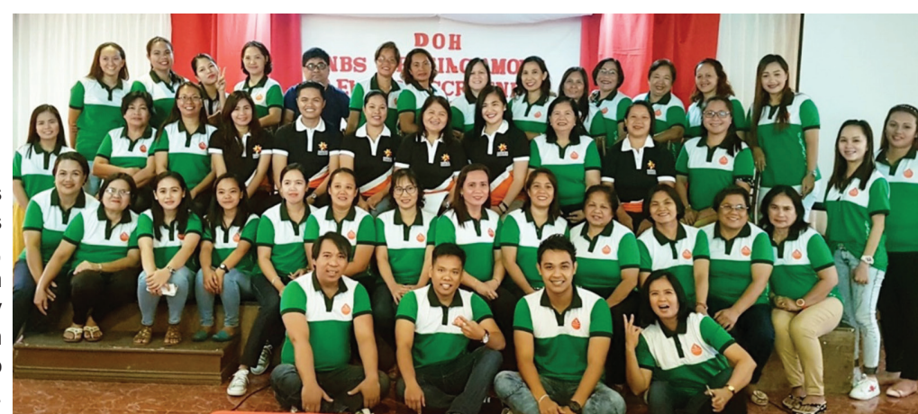
Health professionals attend NBS consultative meeting to address newborn screening implementation issues in Caraga.

To ensure the timely diagnosis and management of babies with common metabolic disorders, NSFs must perform the newborn screening sample collection promptly without errors and complete with demographic details. They must also ensure availability of kits at all times. Unfortunately, these key factors to the success of the program are quite a challenge also in the Caraga Region.