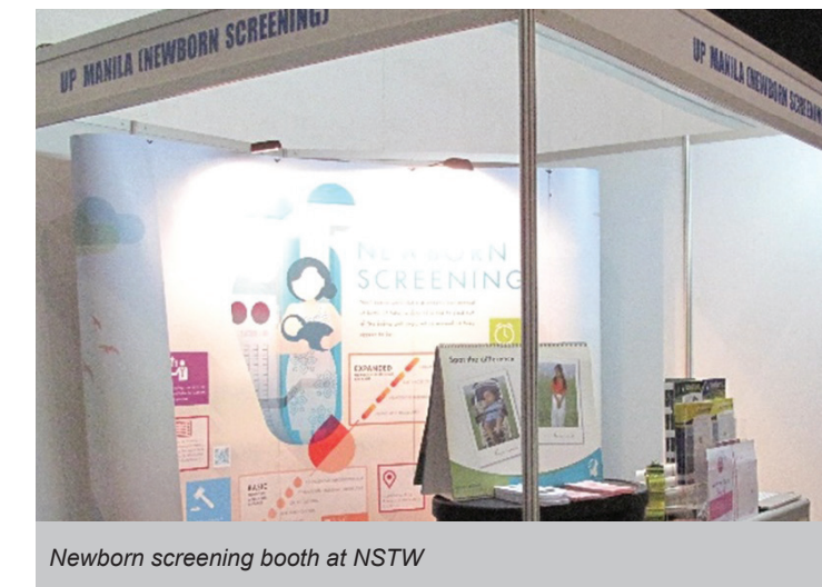
Newborn screening booth at NSTW

NSRC participated in the celebration of the 2017 National Science and Technology Week (NSTW), led by Department of Science and Technology (DOST), at the World Trade Center, Pasay City, on July 11-15, 2017.