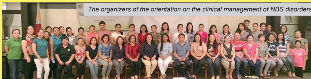
The organizers of the orientation on the clinical management of NBS disorders

The activity helped capacitate health service providers in the management of patients with NBS disorders during their acute