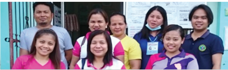
The DOH-RO 7 and PHO Bohol team during one of the facility visits

Bohol has 101 newborn screening facilities, 38 of which are inactive. And facility visits are a great way to monitor the implementation of the newborn screening (NBS) program as well as offer immediate solutions to issues and concerns in the facilities.