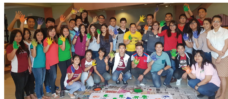
Youth leaders from the different provinces in Central Luzon pledge their commitment to VYLH in a symbolic hand mark printing ceremony during the youth camp in Clark Freeport Zone, Pampanga.

As culminating activity, the participants devised plans to promote the advocacies of the organization. The plans were presented to a panel of reactors from NSC-CL and DOH-RO 3 for feedbacks and recommendations. The program ended with a symbolic imprinting of hand marks to indicate their full commitment to the VYLH network. NDelaCruz