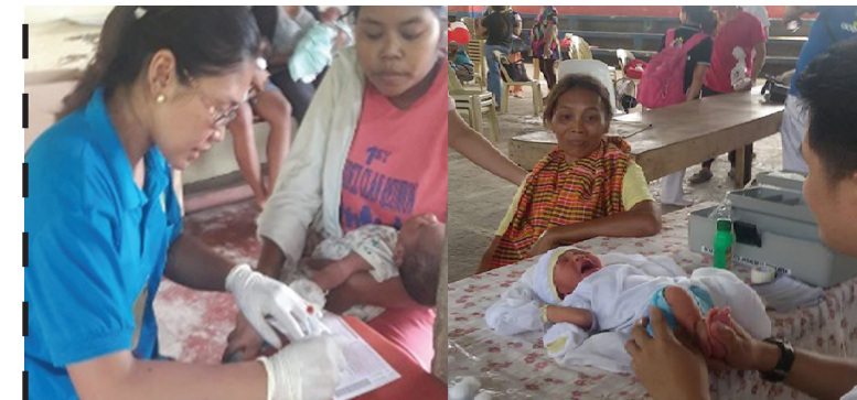
Select babies in Davao City receive free screening during NBS Week.

Meanwhile, the NBS Team of the Department of Health–Regional Office 11 also gave free screening to 34 newborns at the Compostela Valley Provincial Hospital–Montevista and at the Rural Health Unit–Monkayo, Compostela Valley, on October 21, 2016.