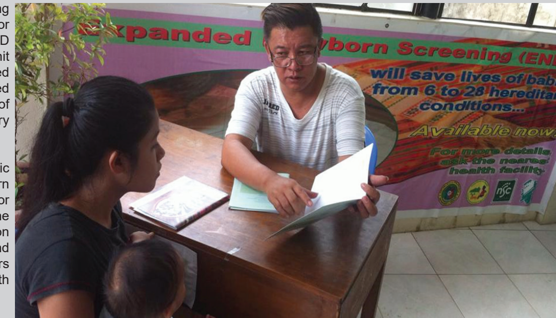
A mother and her baby with G6PD Deficiency consult one of the Peñarrubia RHU personnel.

Besides the cards, Peñarrubia also has the Newborn Screening Mobile Patrol and other traditional strategies such as counseling, patient follow-up, and distribution of information and