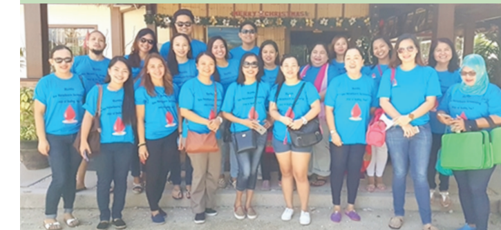
Participants of the zonal planning workshop wearing their batch shirt

The Department of Health-Regional Office 12 conducted a two-day zonal planning workshop at Isla Jardin Del Mar, Glan, Sarangani, on November 28-29, 2016. It was attended by the regional program managers and nurse coordinators within the Mindanao cluster, which is composed of (Regions 9, 10, 11, 12, Caraga, and ARMM).