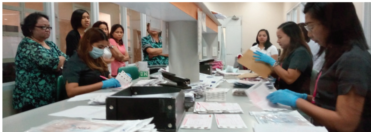
Laboratory personnel work on NBS samples as participants observe during one of the laboratory exposure trips.