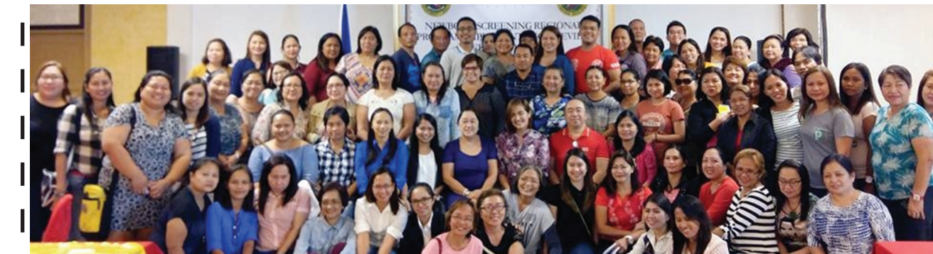
Participants of the Program Implementation Review join the organizers and staff of DOH-RO 11 for a photo after the two-day workshop.

The Department of Health-Regional Office (DOH-RO) 11 gathered newborn screening facilities (NSFs) from all over Davao region for the Program Implementation Review at the Royal Mandaya Hotel, Davao City, on November 15-16, 2016.