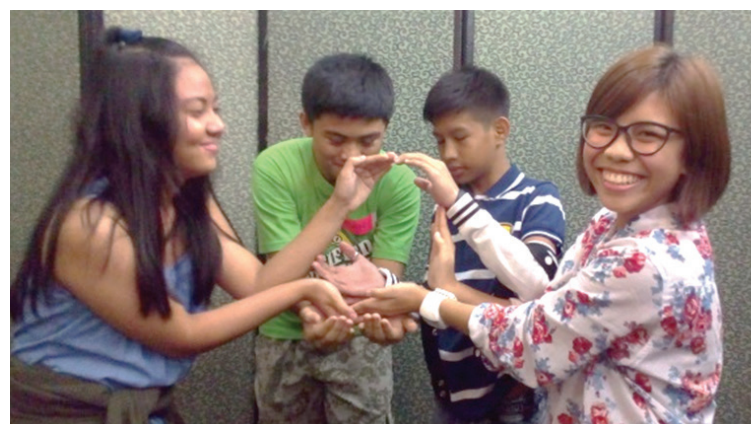
Patients play charades during the reunion in San Juan City.

The Department of Health-National Capital Region Office, in partnership with the Newborn Screening Center-National Institutes of Health, gathered patients found positive in one of the disorders being screened for a reunion at the Greenhills Elan Hotel Modern, San Juan City, on November 26, 2016.