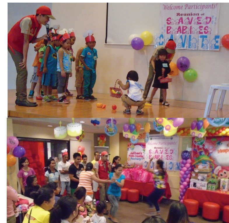
Counterclockwise: (1) Children from Cavite Province play parlor games. (2) Parents from Quezon Province enjoy games prepared for them as well. (3) Kids flock to the mascot for photos in Laguna Province.

The Newborn Screening Center–Southern Luzon, in coordination with the Department of Health–Regional Office 4A, held the annual Reunion of Saved Babies for the provinces of Cavite, Quezon, and Rizal on November 12, 19, and 26, 2016, and for Laguna and Batangas on December 3 and 7.