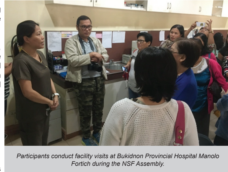
Participants conduct facility visits at Bukidnon Provincial Hospital Manolo Fortich during the NSF Assembly.

Some 80 NBS coordinators from both private and government NSFs in the region participated in the event. Speakers from the Newborn Screening Center-Mindanao were also invited to provide developments and updates on Expanded Newborn Screening. Further, accomplishments and regional status from 2015 were also reported. GBSamante