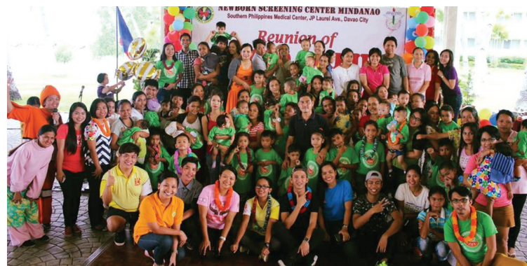
Participants and organizers of the Reunion of Saved Babies in Davao City

It was Hawaiian theme for this year when Newborn Screening Center-Mindanao held the Reunion of Saved Babies at the Waterfront Insular Hotel, Davao City, on November 5, 2016.