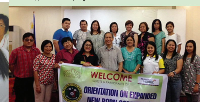
Expanded NBS Orientation participants from Olongapo City, Zambales

A total of 457 Newborn Screening Facility Coordinators from 7 provinces in Central Luzon attended the orientation and pledged their support for the program.