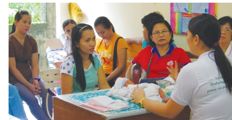
Health workers interact more closely during the on-site trainings.

From July to September 2015, DOH-RO 1 NBS Team held 12 on-site trainings to rural health units, district hospitals, and provincial hospitals, reaching a total of 304 health workers.