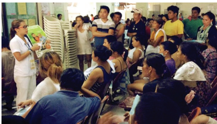
NBS Ward Class at SPMC OB Ward

On the last day of the celebration, a two-hour interactive discussion was held at JICA Building on the Expanded NBS program and its panel of disorders. The discussion was attended by patients as well as healthcare practitioners. ATadlas