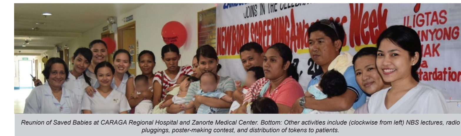
Reunion of Saved Babies at CARAGA Regional Hospital and Zanorte Medical Center. Bottom: Other activities include (clockwise from left) NBS lectures, radio pluggings, poster-making contest, and distribution of tokens to patients.

In celebration of the Newborn Screening (NBS) Week, Newborn Screening Center (NSC)–Mindanao enjoined all health and birthing facilities from the different regions in Mindanao to center all celebrations and campaigns on newborn screening.