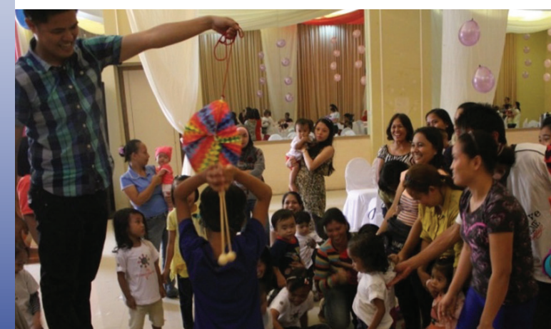
Parents and their children have fun during the Reunion of Saved Babies.

The reunion was organized by the Newborn Screening Center-Mindanao and Newborn Screening Continuity Clinic of Zamboanga City Medical Center to promote camaraderie and support among the families of saved babies.