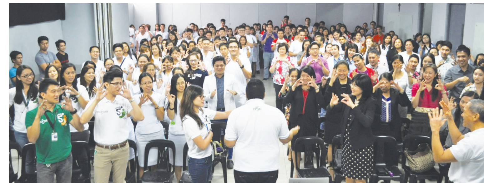
Officers, staff, and guests of NSC-CL during its fifth anniversary celebration at AUF Sports and Cultural Center, Angeles City.

The Newborn Screening Center–Central Luzon (NSC-CL) celebrated its fifth anniversary in a simple ceremony held on October 20, 2015.