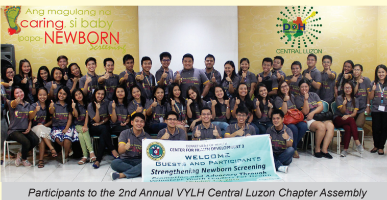
Participants to the 2nd Annual VYLH Central Luzon Chapter Assembly

The activity ended with the traditional rainstorm closing ceremony where participants pledged their commitment to uphold the advocacies and values of VYLH-Philippines. RDione