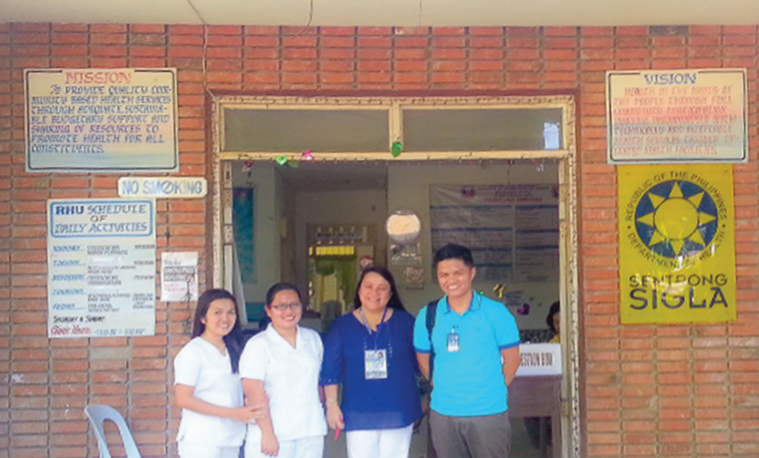
Staff of RHU Liloy in front of the facility