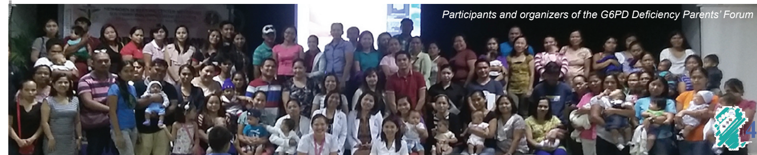
Participants and organizers of the G6PD Deficiency Parents' Forum

The overwhelming response generated in this forum inspired SPMC NBSCC to hold more parents' forums on metabolic disorders in the coming months. ADTadlas