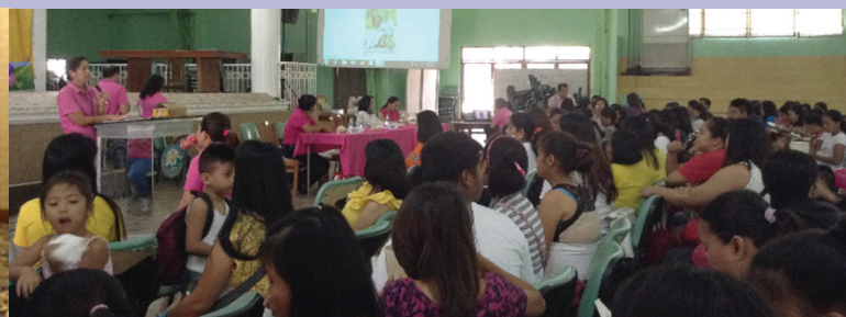
Buntis Day celebrated at LCC Auditorium Central II, Calamba, Laguna

The expectant mothers actively participated in the discussions and games. Selected participants were also given free newborn screening upon their delivery. Topics discussed were prenatal care, newborn care, breastfeeding, newborn screening, and introduction to the Expanded Newborn Screening in the Philippines.