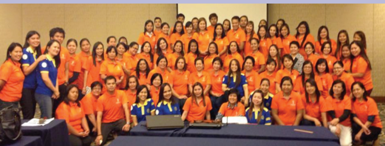
Participants from Batangas during one of the ENBS Orientation roadshows