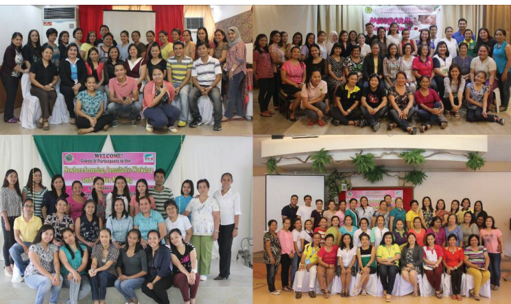
Participants and organizers of Zamboanga Peninsula Cluster Meetings (clockwise from top left): Zamboanga City and Isabela City Cluster, Zamboanga Del Sur Cluster, Zamboanga Del Norte Cluster, Zamboanga Sibugay Cluster