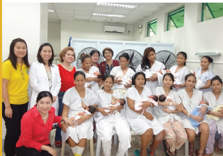
Above: Mass screening held at Rizal Medical Center on October 24, 2014, sponsored by the Zonta Club of Greater Rizal and Inner Wheel Clubs of the Philippines, Inc. Below: Mass screening held at Novaliches District Hospital on October 17, 2014.