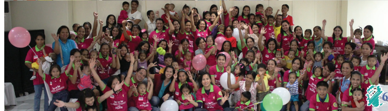
Below: Department of Health-Regional Office VI and Newborn Screening Center-Visayas hold Reunion of Saved Babies for Panay and Guimaras Islands at Sarabia Manor Hotel, Iloilo City, on October 24, 2014.