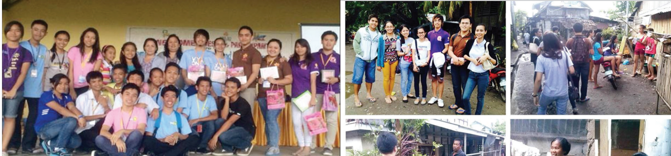
Left: VYLH-Dumaguete observes NBS Month with a door-to-door campaign at Brgy. Canday-ong, Dumaguete City, on October 6, 2014.