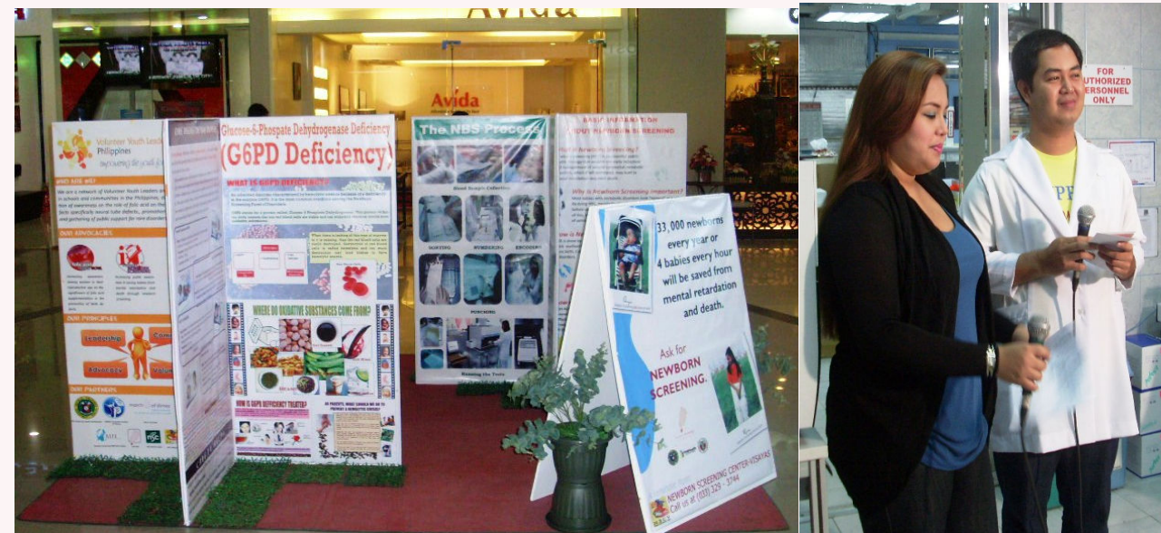
1. NBS Exhibit at SM City Iloilo – October 1-8, 2012 2. NBS Special Feature in GMA Iloilo morning show Arangkada - October 3, 2012