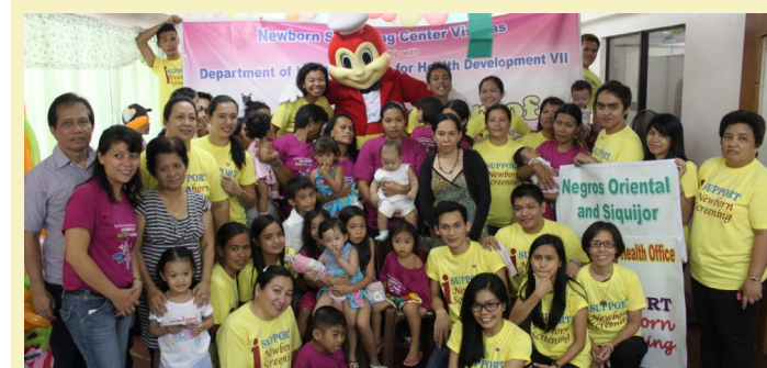
The saved children with their parents pose with the organizers and Jollibee mascot after series of games, intermissions and ice breakers.

27 October 2012, Visayas DUMAGUETE CITY- In cooperation with Dumaguete City Health Office, Newborn Screening Center-Visayas in partnership with Center for Health Development-Region 7 (CHD-7) organized the 1st Reunion of Saved Babies for the Provinces of Negros Oriental and Siquijor on October 27 at the City Health Office's Conference Room.