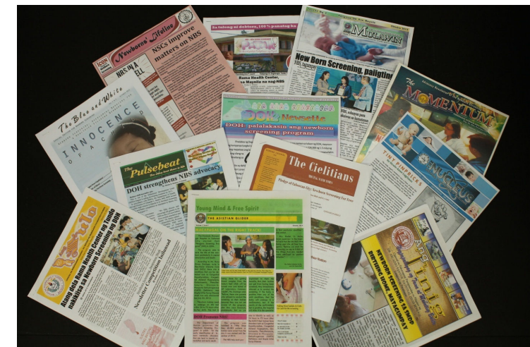
Twelve (12) entries for the Newsletter Competition launched by the CHD-MM for secondary schools in Manila, Parañaque, Caloocan and Quezon City

(12) entries were selected for the final judging.