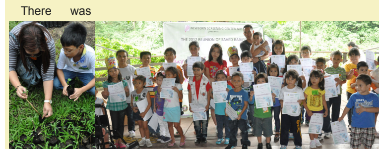
The saved children show their certificate as protectors of mother earth after the successful tree planting activity.

28 October 2012, NCR-South Luzon QUEZON CITY - Forty (40) saved babies and their parents were gathered on October 28 (Sunday) at the Superferry Pavillion of the La Mesa Eco Park for a program filled with fun and prizes. To make it more meaningful, the organizers aptly dubbed the event "Saved Babies Help Save Mother Earth". Volunteers from VYLH-Philippines NCR-South Luzon participated in the activity as the event's emcees. The group also presented a Filipino children's story entitled "Si Emang Engkantada at ang tatlóng batang makulit" through participative storytelling in which the children played a part in the story's delivery and learn about environmental conservation simultaneously.