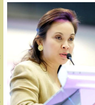
Senator Loren Legarda, co-author of Newborn Screening Act of 2004

"Our children and the children of the next generation need not suffer from severe mental retardation, cataract, anemia, kernicterus, and even death when they could lead normal lives," said Senator Loren Legarda during the 10th Annual Newborn Screening Convention at the SMX Convention Center, Mall of Asia, Pasay City, October 2.