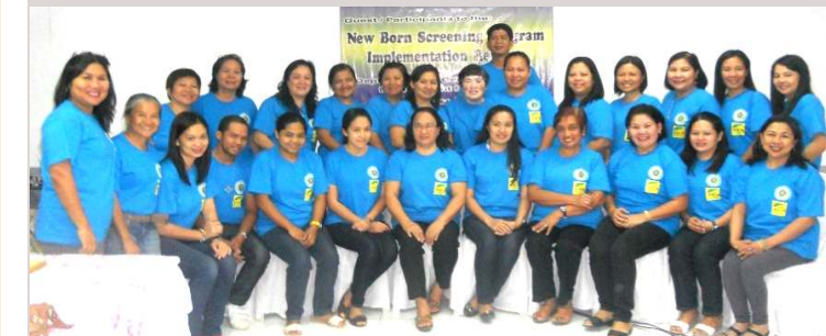
The organizers of the Program Implementation Review conducted in General Santos City on January 23-25, 2012

The PIR also commended exemplary and outstanding NBS facilities. The awardees were Well-Family Midwife Clinic-Enriquez (General Santos City), Antipas Medical Specialists Hospital, Inc.