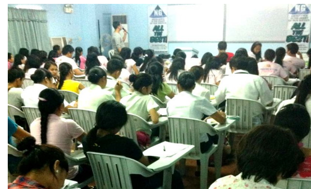
Participants to the lecture-seminars organized by NSC-Visayas and NG Review Center on February 8 and 15, 2012 in Iloilo and Bacolod

The Newborn Screening Center (NSC)-Visayas, in partnership with the NG Review Center, conducted free seminars called "Baby's Day Out" on February 8 and 15 in Iloilo City and Bacolod City, respectively.