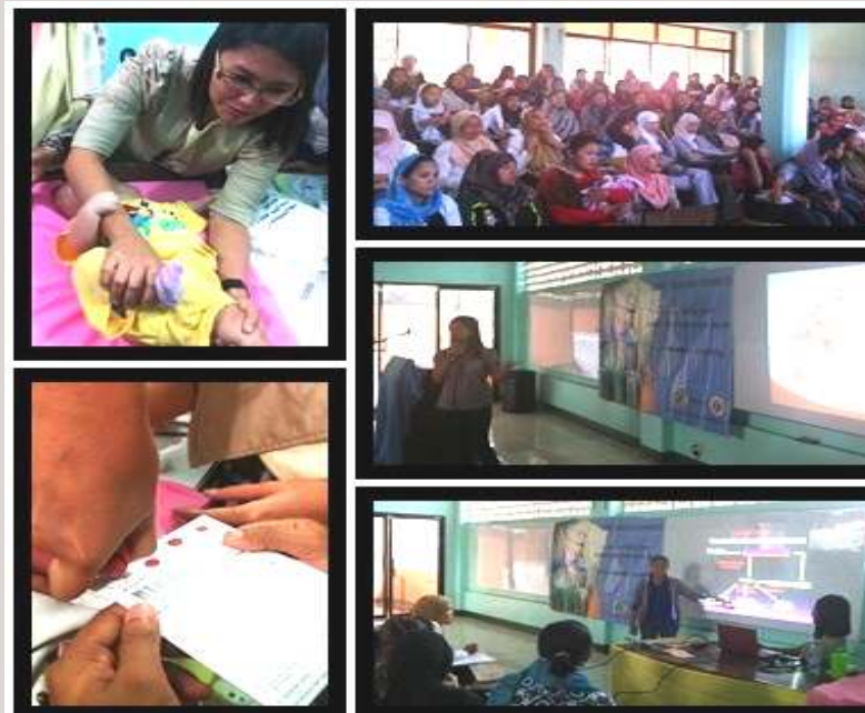
The photos show the newborn screening training organized and conducted by the Newborn Screening Center-Mindanao and Integrated Provincial Health Office-Lanao del Sur on February 9, 2012 in Marawi City.

To address the problem of unsatisfactory samples collection from newborn screening facilities (NSFs), the Newborn Screening Center–Mindanao (NSC-M), in coordination with the Integrated Provincial Health Office (IPHO) in Lanao Del Sur, conducted the Newborn Screening Orientation/Training on February 9, 2012, in Marawi City.