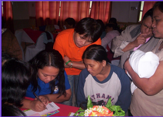
A demonstration on the proper collection of blood sample was also conducted by the CHD-NM