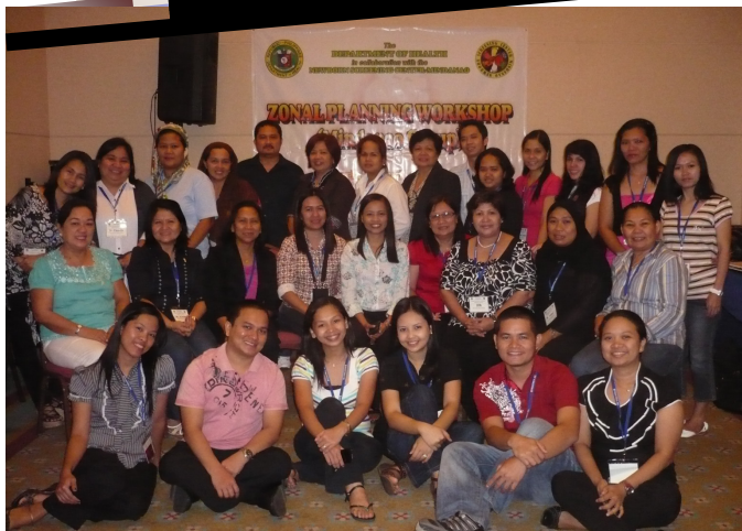
Implementers of Newborn Screening Program in Mindanao

The Zonal Planning Workshop of the Mindanao Group was held on March 3 and 4, 2010 as a collaborative activity of the Department of Health and the Newborn Screening Center—Mindanao. NBS Coordinators and NBS Nurse Coordinators from CHD Regions 10, 11, 12, CARAGA and ARMM attended the workshop. Also in attendance were representatives of seven (7) DOH-retained hospitals and three (3) devolved hospitals.