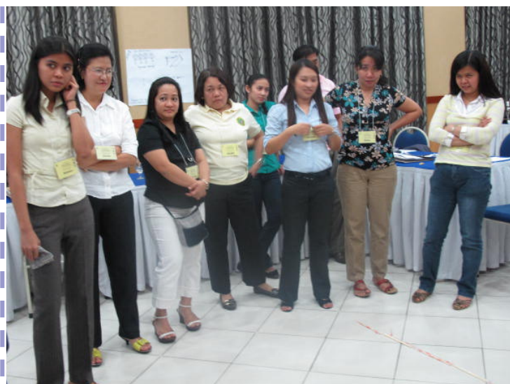
The Regional Medical and Nurse Coordinators in Luzon participating in the activities prepared by the Newborn Screening Center—National Institutes of Health