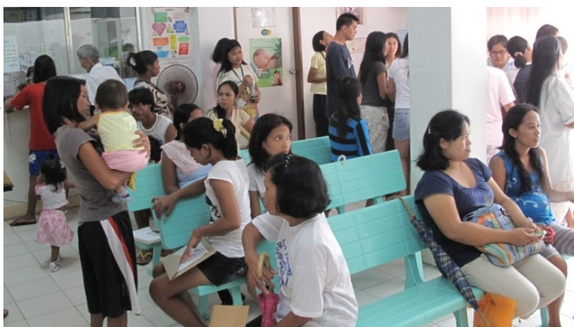
Child & Maternal Care Day at Lamao Health Center, Limay, Bataan