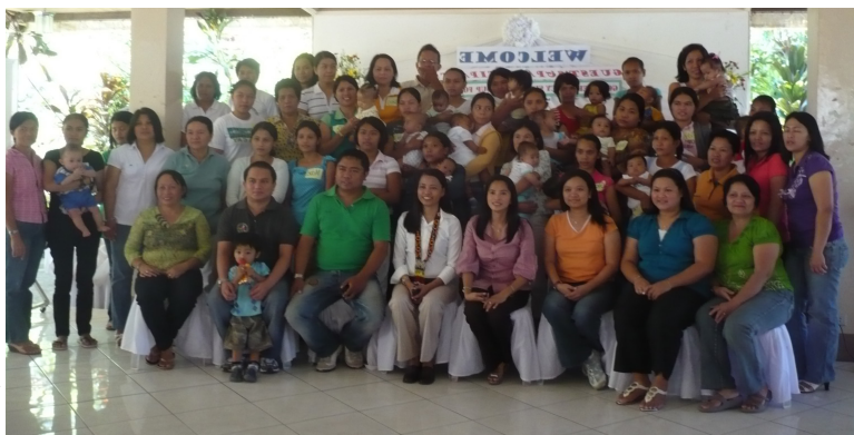
The organizers and parents who attended the G6PD Deficiency Support Group Forum at on March 12 at Malaybalay, Bukidnon