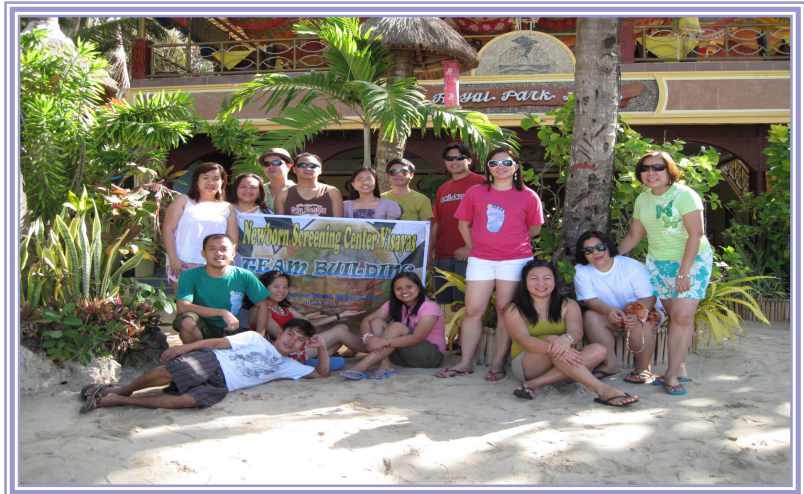
Staff of NSC-Visayas during the recently held Teambuilding Activity

With a revitalized sense of teamwork and camaraderie, the NSRC family looks forward to bigger challenges and responsibilities in fulfilling the Center's goal of safeguarding babies' health through newborn screening.