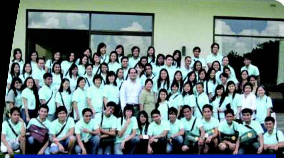
LUZON Hotel Kimberly, Tagaytay City July 2-4, 2010