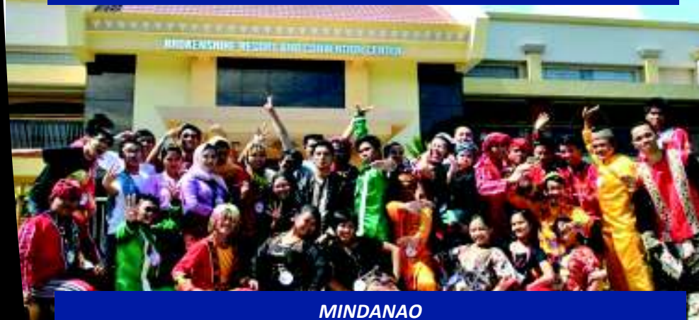
MINDANAO Brokenshire Resort and Convention Center, Madapo, Davao City July 29- August 1, 2010