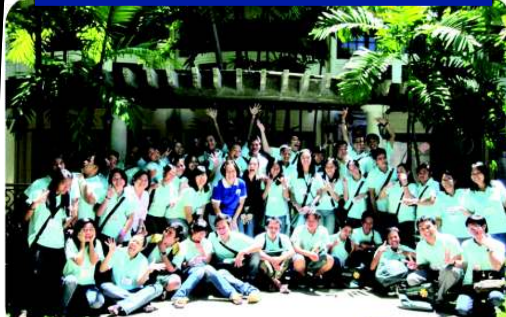
VISAYAS El Salvador Beach Resort, Danao City, Cebu July 16-18, 2010