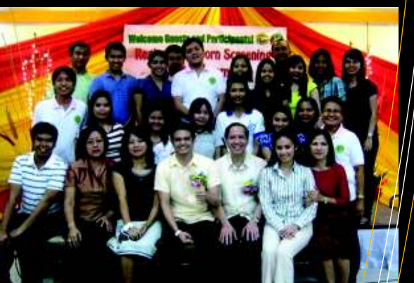
CHD-II with representatives from NSC-CL during the NBS Regional LGU Assembly held on December 14, 2010 in Tuguegarao City

An open forum was carried out to address questions and concerns regarding the program. The event was concluded with the participants signing a Memorandum of Agreement expressing support for the program. -C. Monieno