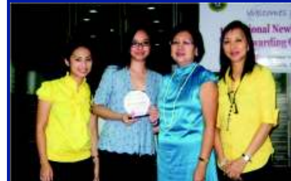
The newborn screening team in Cagayan Valley gives recognition to outstanding newborn screening facilities as part of Newborn Screening Week Celebration.

As part of the Newborn Screening Week celebration, the Department of Health-Center for Health Development for Cagayan Valley (CHD-CV) conducted a Program Implementation Review (PIR) and Regional Awarding Ceremony of Newborn Screening Facilities (NSFs) on October 14, 2010 at the Crown Pavilion, Tuguegarao City. The activity was attended by the chiefs/heads and NBS Coordinators of the different newborn screening facilities in the region.