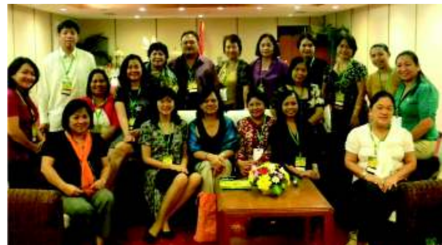
The Philippine Delegation to the 7th ASIA-PACIFIC REGIONAL MEETING held on October 03-06, 2010 at Bali, Indonesia.

The Philippine delegation composed of representatives from the Philippine Health Insurance Corporation Inc., Department of Health (DOH), Centers for Health Development (CHDs), Newborn Screening Centers and National Institutes of Health (NIH) Philippines attended the recently concluded 7th ASIA-PACIFIC REGIONAL MEETING of the International Society For Neonatal Screening (ISNS) hosted by the Indonesian Pediatric Society (IPS) and the International Society for Neonatal Screening (ISNS). The Conference with the theme "Universal Coverage for Newborn Screening – A Critical Step Towards Achieving Beyond MDG 4" was held at Bali – Indonesia from October 03 to 06, 2010.