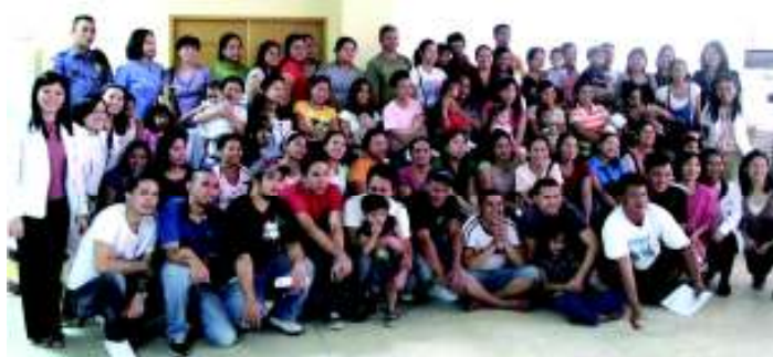
Organizers and parents of CAH patients pose for a group picture after the CAH Forum held at the PGH Dietary Conference Hall on December 7, 2010

CAH is an endocrine disorder that leads to severe salt loss, dehydration, and abnormally high levels of male sex hormones in both males and females. If not detected and treated early, babies with CAH may die within 7-14 days. Those who survive may have abnormal development of primary and secondary sex characteristics. - I Fortugaleza