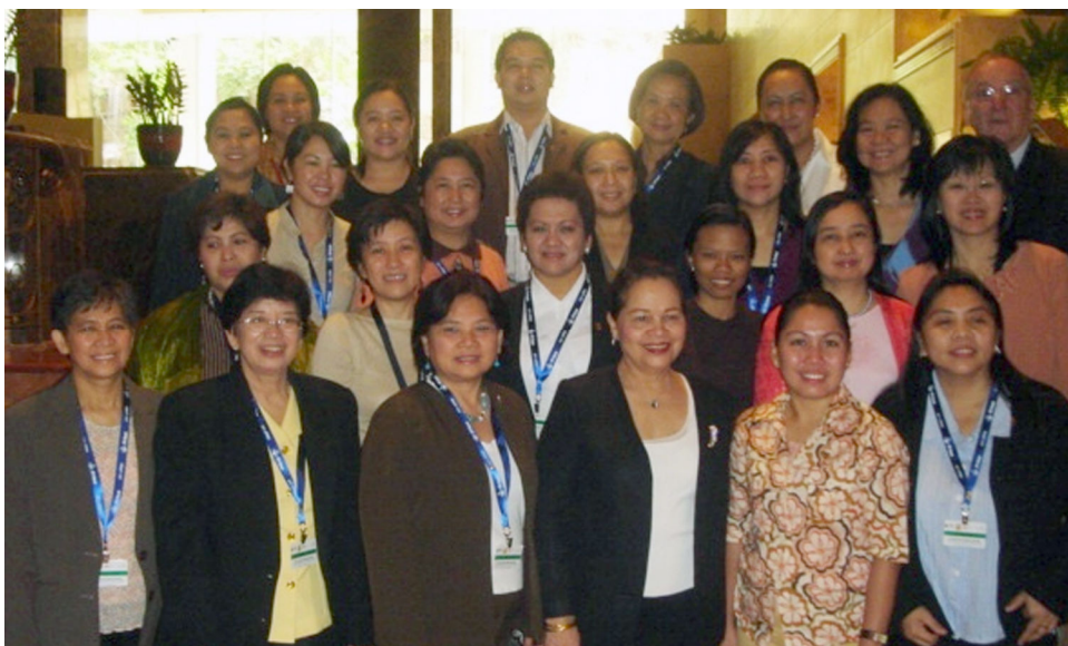
Philippine delegates to the 5th Asia Pacific Regional Meeting for the International Society for Neonatal Screening (ISNS) held in Singapore. See story in page 3