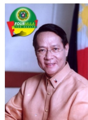
Sec. Francisco T. Duque III

DOH Secretary Francisco T. Duque reiterates that every baby born in the Philippines is offered the opportunity to undergo newborn screening and be spared from heritable conditions that can lead to mental retardation and death if undetected and untreated.