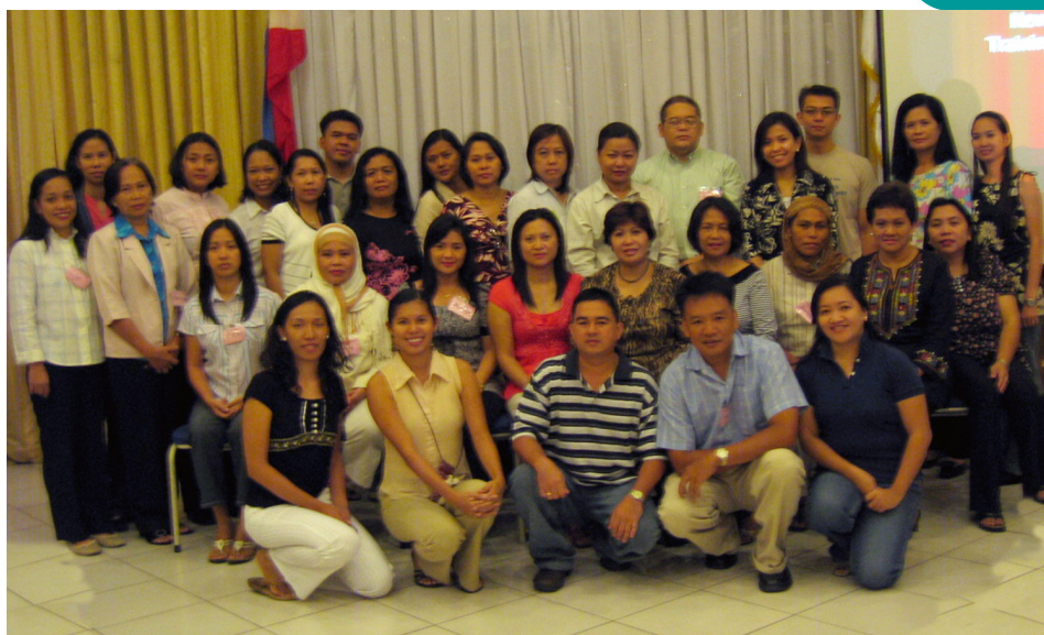
The participants of the 2007 Newborn Screening Training of Trainers conducted at Hotel Kimberly on July 4 - 6, 2007