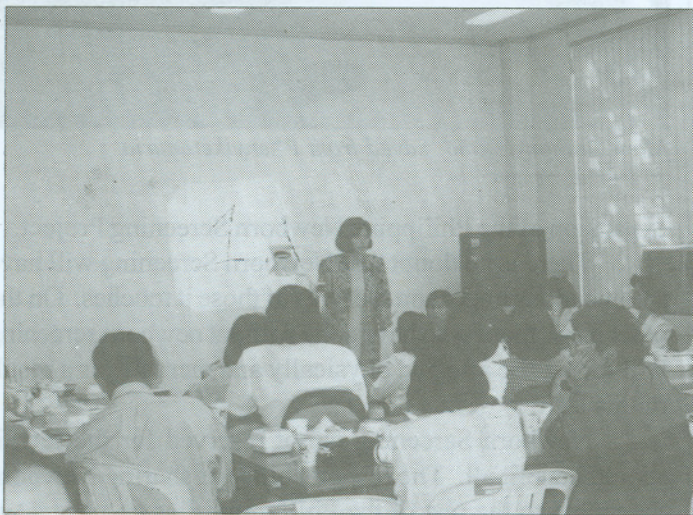
Participants during the Feb. 20 Luzon Phase II Orientation Seminar.

Newborn Screening, the essential tool in pediatric medicine worldwide, has now found its way to more hospitals around Metro Manila. The new participating hospitals include Jesus Delgado Memorial Hospital, Hospital of the Infant Jesus, Makati Medical Center, Manila Sanitarium Hospital, The Medical City, and University of Santo Tomas Hospital. The representatives were invited to attend the workshop held at the National Institutes of Health last February 20, 1998 and since March 15, the Newborn Screening Laboratory has been running their samples.